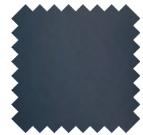
213 Blu Avio